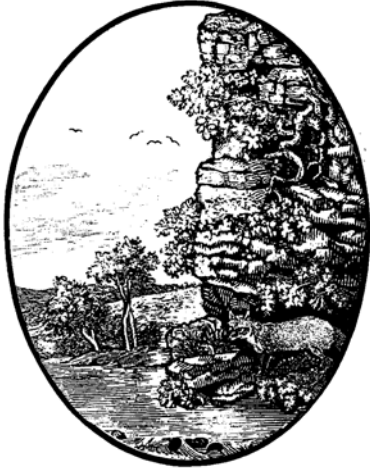
Neshaminy Preservation Coalition