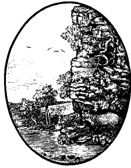
Neshaminy Preservation Coalition