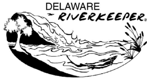
Delaware Riverkeeper Network