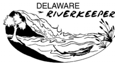
Delaware Riverkeeper Network